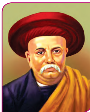
Dr. Bhau Daji Lad

The 'Asiatic Society' was established at Kolkata by the British. Many Indian and western scholars started study of Indian culture. The manuscripts in Sanskrit, Persian and other languages were examined and research was published.