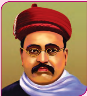
Gopal Krishna Gokhale

Gopal Krishna Gokhale founded the 'Servants of India Society' in 1905. To create love for the country, teach them sacrifice of self interest, differences between religion and caste should be destroyed and to create social harmony, spread of education were the main objectives of the servants of India society.