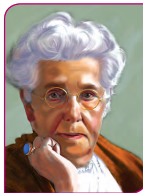
Dr. Annie Besant

1916, under the leadership of Lokmanya Tilak, an attempt was made to resolve the dispute in the Indian National Congress. In the same year there was an agreement between Indian National Congress and Muslim League known as the 'Lucknow Pact'. According to this pact, the Indian National Congress agreed to separate electorates to Muslims and Muslim League agreed to support the Indian National Congress in its work for getting political rights to India.