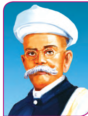
Dr. R. G. Bhandarkar

Indian scholars like Dr. Bhau Daji Lad, Dr. R. G. Bhandarkar made intensive study of ancient Indian culture. After understanding that we are blessed with glorious ancient tradition, the Indians were awakened with a sense of Identity. The 'Bhandarkar Oriental Research Institute' is working since last 100 years in Pune.